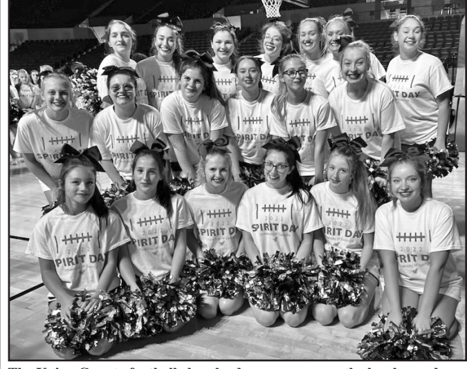
The Union County football cheerleaders were among the local squads invited to Sanford Stadium on Saturday to perform during halftime of Georgia's 39-22 victory over Kent State.

Support the Spandex' serves up Friday night fun at UCHS