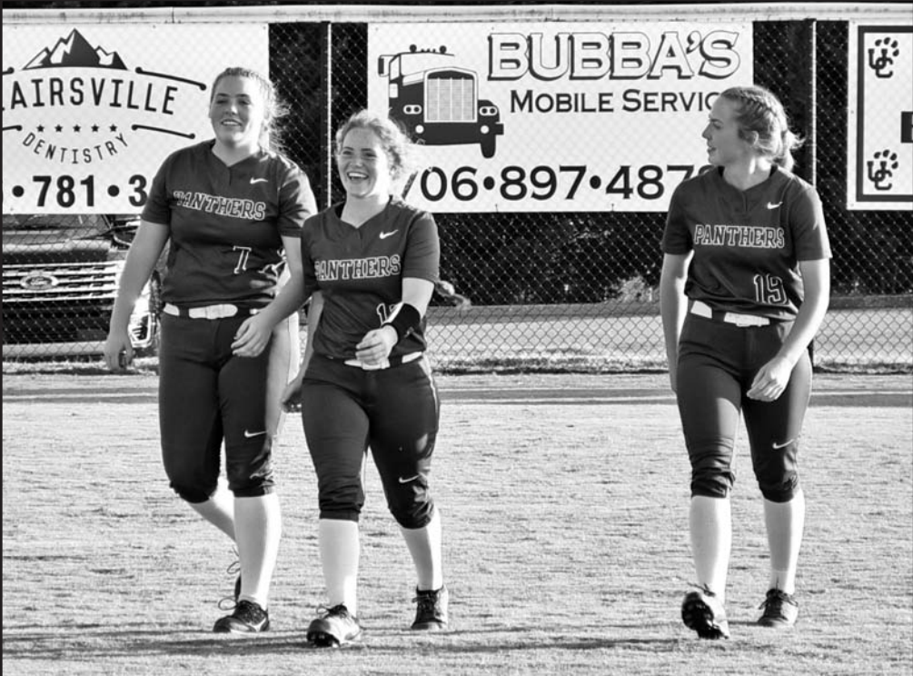
UCLS Softball Senior Night